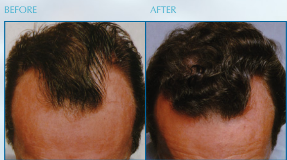
Male: Significant new hair growth in the frontal area.