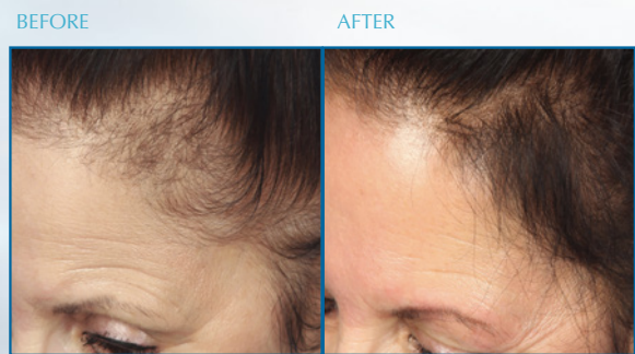
Female: Denser, fuller hair across the entire scalp.